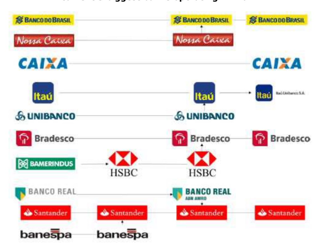
Figure 1 – Main mergers and acquisitions leading to the current 5 biggest banks operating in Brazil